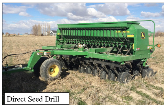
Direct Seed Drill

Equipment rental information Is available on our website, or call our office for info.